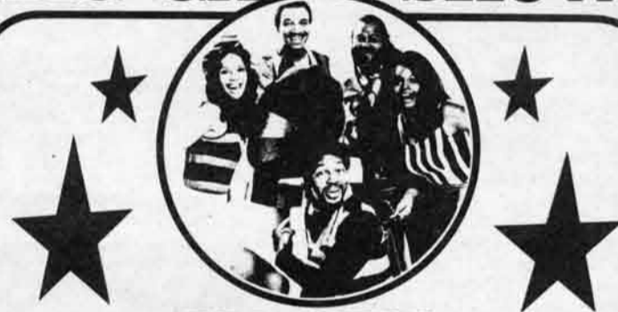
THE 5th DIMENSION