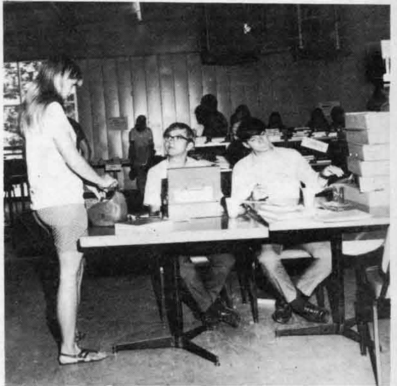
The Bookpool in happier days.